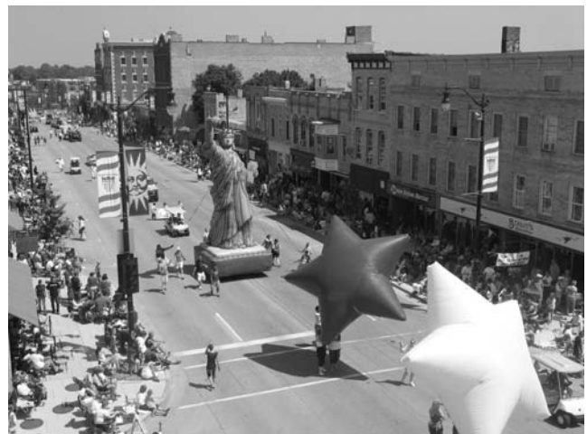
The Racine 4th of July Parade route went along Main Street and through Downtown