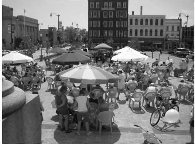
Many events were held at Monument Square throughout the summer

Below are photographs from some of the special events held in Downtown Racine this past summer.