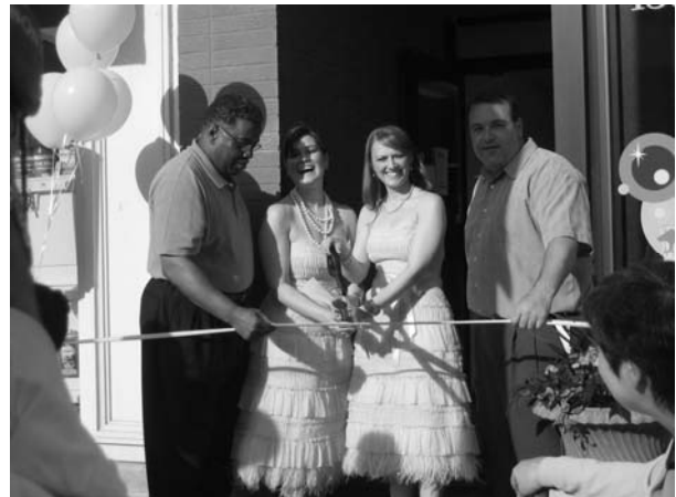
Ribbon cutting ceremonies were held to welcome new businesses to Downtown Racine.